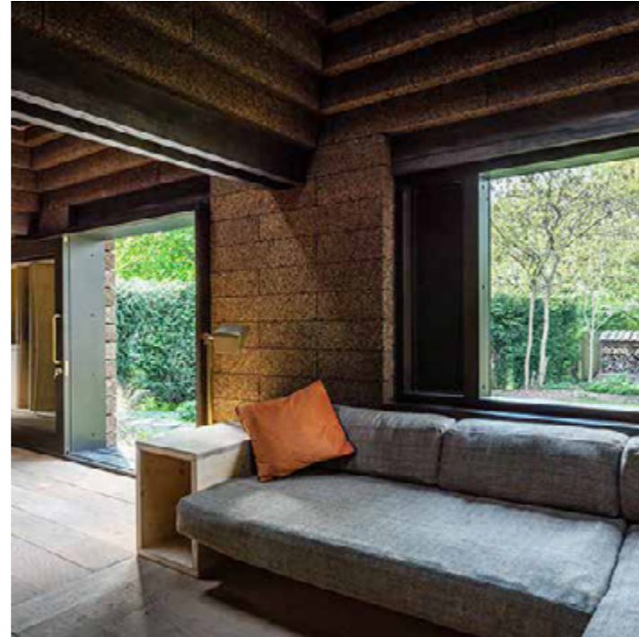
Cork House, Matthew Barnett Howland with Dido Milne and Oliver Wilton

The Cork House is a residential extension project which explores the use of low carbon materials. Solid structural cork is used for the walls and roof of this building, resulting in the building having exceptionally low whole life carbon.