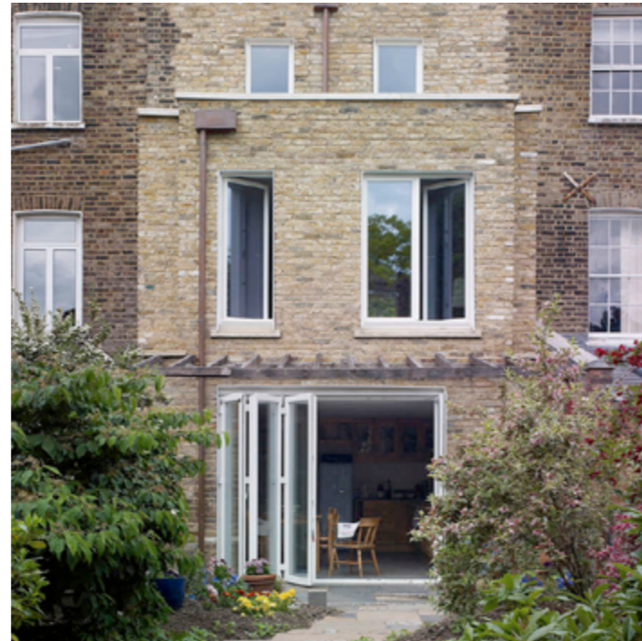
80% House (London) by Prewett Bizley Architects

An extension to a townhouse that includes living, cooking and dining spaces. A rooftop extension adds a third bedroom-cum-study. The house achieves an 80% reduction in CO2 emissions, primarily by incorporating high levels of insulation and air tightness. Fresh air is supplied by an MVHR system. A photovoltaic array on the roof with a provides a little over half the annual electricity requirement.