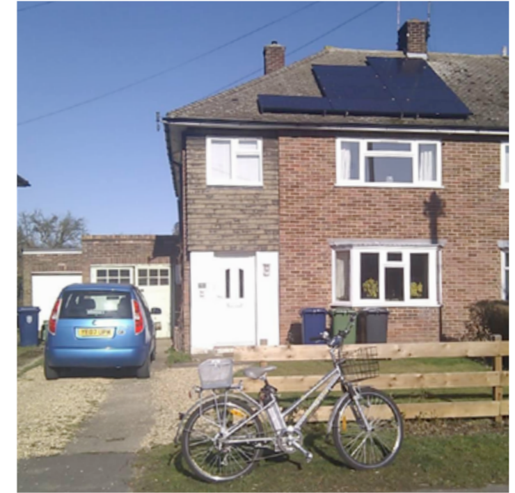
Bill Powell's SuperHome (Cambridgeshire)

This was a householder refurbishment project of an existing 1950's house. The owner implemented a series of energy saving measures, including the installation of an Exhaust Air Heat Pump, which led to an overall reduction by 68% of the home's carbon use.