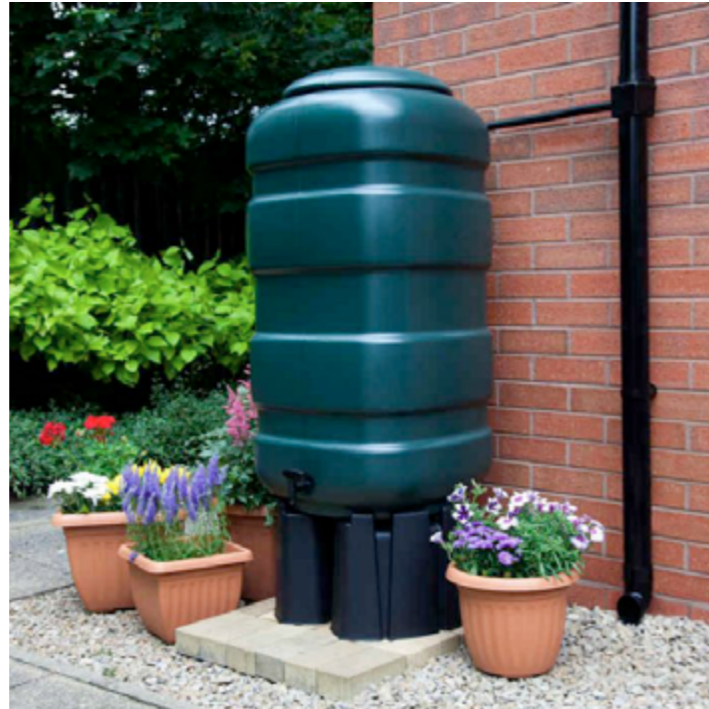
Example of domestic water management; water butts

A water butt is essentially a large container used to capture and store rainwater. When attached to a downpipe, the water butt collects the rainwater that lands on the roof of a building so it can be used later. It is this time of year, when rainfall has been scarce, that water butts become really useful.