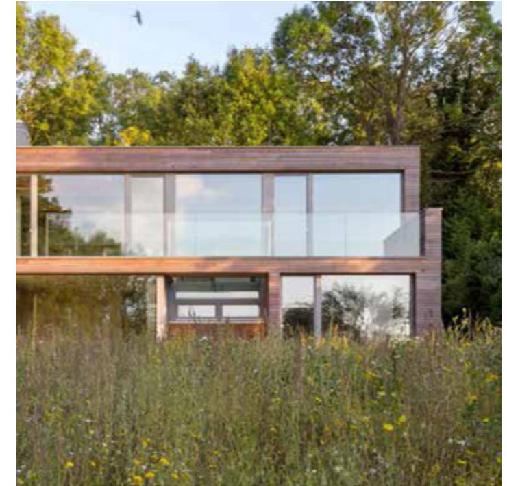
Lark Rise (Buckinghamshire), bere Architects

Lark Rise is an all-electric, two-bedroom guest house designed to Passivhaus standards, producing at least twice as much energy in a year as it requires, while maintaining a very high level of comfort all year round. Ventilation is provided through MVHR units.