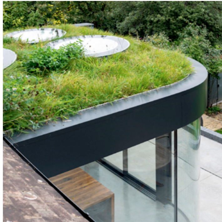
The Black Curve (Bromley) by Ar'Chic A rear house extension that includes the creation of a garden terrace. The green meadow roof installed as part of the extension will enhance the insulation of the home, reducing energy usage, and give opportunities to wildlife to take over.