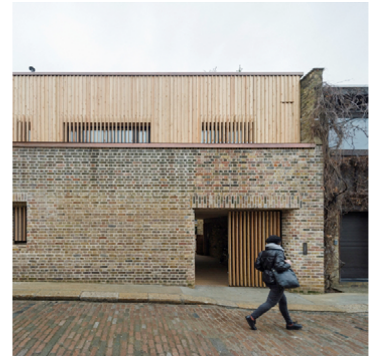
Max Fordham House (London) by bere Architects

Designed in collaboration with the renowned physicist and engineer Max Fordham, the elevations of this house are largely driven by the requirement to accommodate horizontally-sliding thermal shutters within the internal fabric of the building. Automatically operated, insulated internal window shutters have been developed for the project, and the intention is to test the completed building without any supplementary heating.