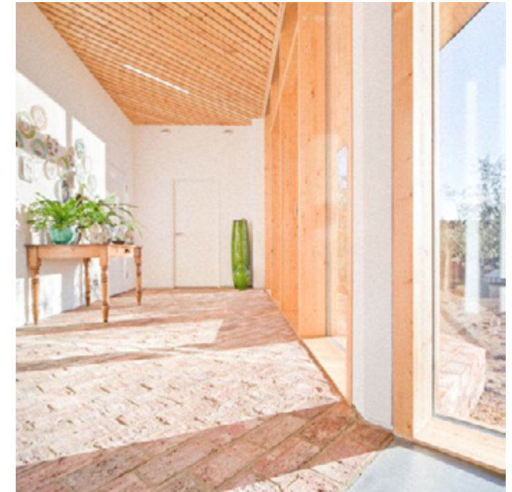
Manor Farm (Oxfordshire) by Transition by Design Extension to a listed Georgian country house that provides the home with new kitchen, dining room, garden room and utility spaces and follows sustainable design principles. The solar gains are optimised to the south allowing light and warmth to pour into the garden room yet protected in excess summer heat by the oversailing roof