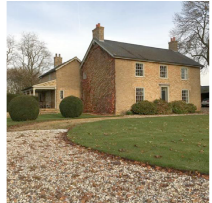
1860s Farm (Huntingdon), pump by Finn Geotherm

A ground source heat pump was installed in this 1860s farmhouse to replace an oil-fired boiler. The pump heats up radiators throughout the house, as well as provides hot water. The heat pump also runs entirely on renewable energy generated by the farm's own turbine, making the farm carbon positive.