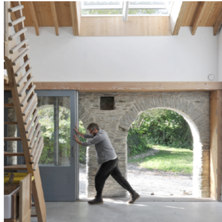
The Linney (Devon) by Casswell Banks Architects

An old 45 sq.m stone barn is refurbished to provide a home for a family of 6. The existing stone walls are left intact and a secondary skin is built behind it, allowing for a more flexible configuration of the interior, built with sustainable materials, without compromising the original walls. A series of lightweight insertions and sliding doors create an open plan ground floor that can be used in many different ways by the family.